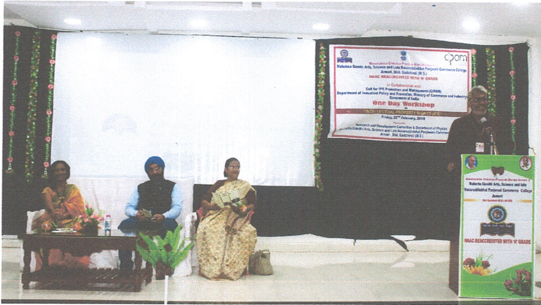
1.7 Feedback given by Participant