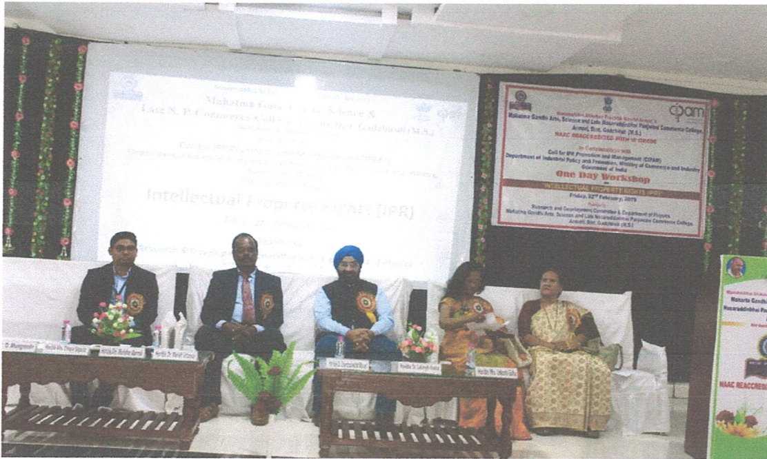
1. 1 Inauguration of One Day Workshop on IPR