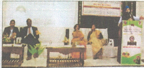
कार्यशाळेचे आयोजन करण्यात आले होते. यावेळी उद्घाटनाप्रसंगी ते बोलत होते.

स्थानिक महात्मा गांधी कला, विज्ञान व स्व. न. पं. वाणिज्य महाविद्यालयात संशोधन व विकास समिती, भौतिकशास्त्र विभाग आणि भारत सरकार कॉर्पस अँड इंडस्ट्री मंत्रालयाच्या सीआयपीएएम च्या संयुक्त विद्यमाने 'इंटेलेक्च्युअल पॉपर्टी राईट्स' या विषयावर एक दिवसीय