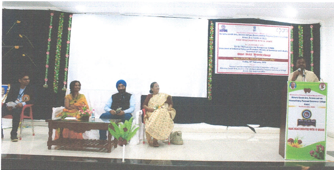
1.8 Feedback given by Participant